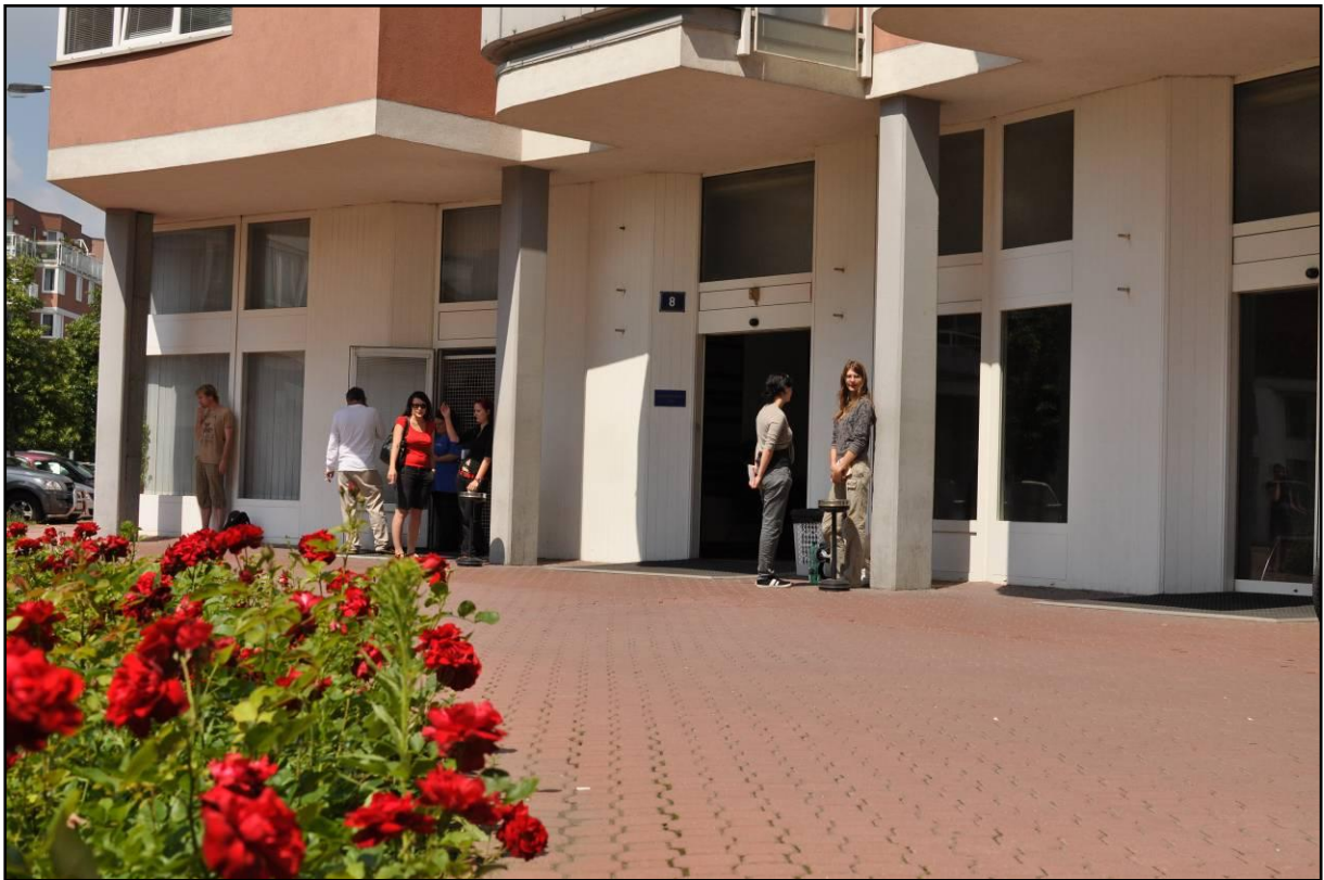
CHARLES UNIVERSITY IN PRAGUE

faculty of humanities Charles university in Prague exchange